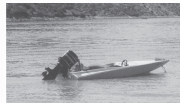
Joey's first ski boat. 16 foot '69 Regata ski boat with a 125HP Mercury. Giddy up!